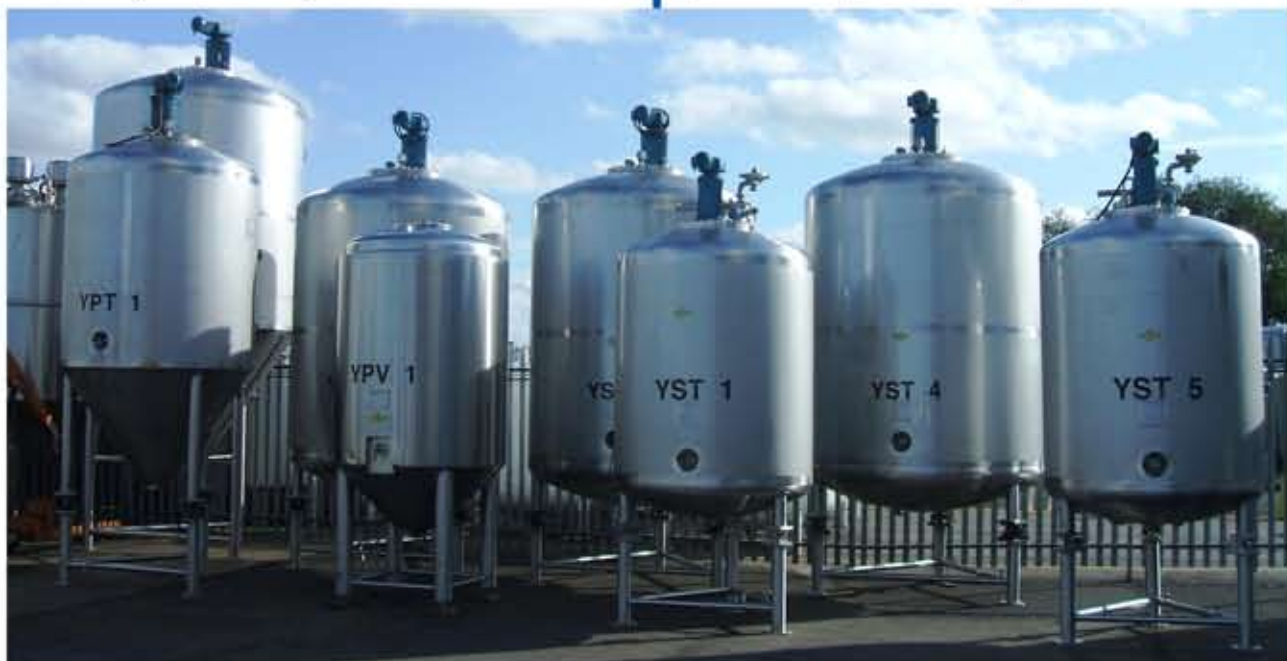
COMPLETE YEAST PLANT—MANUFACTURED BY SCANDI BREW/ T.MUSK INCLUDING DOCUMENTATION, FLOWCHARTS ETC